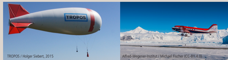
TROPPOS / Holger Siebert, 2015