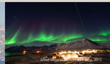
Alfred-Wegener-Institut / René Burgi, 2015